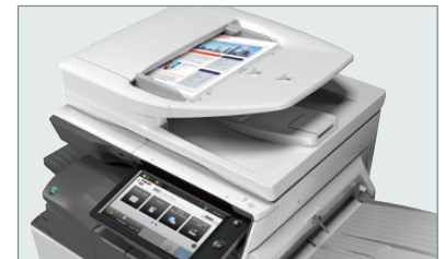
Sharp's ImageSEND™ feature provides one-touch distribution to email, cloud applications and more.