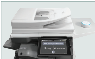
MX-4051 shown with available Sharp MFP Voice feature powered by Alexa.