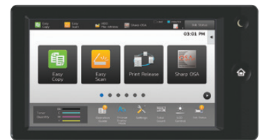
Award-winning 10.1" (diagonally measured) customizable touchscreen display.