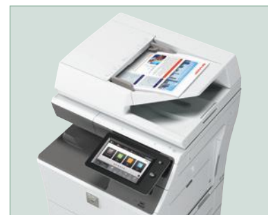
Sharp's ImageSEND™ feature provides one-touch distribution to email cloud applications and more.