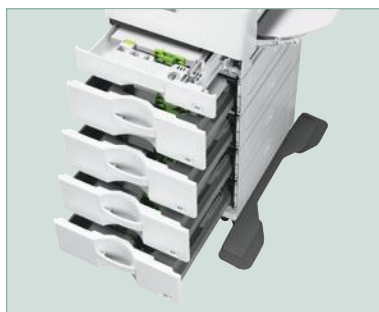
Offers up to six paper sources for a maximum 2,700-sheet capacity (shown with optional trays).