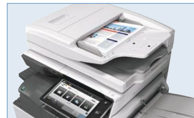
Sharp's ImagesSEND™ feature provides one-touch distribution to email, cloud applications and more.