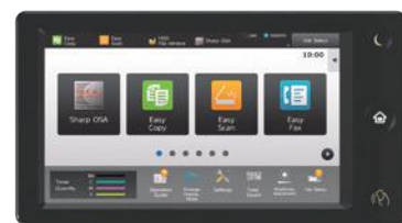
Award-winning 10.1" (diagonally measured) customizable touchscreen display.