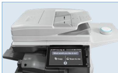
MX-6071 shown with available Sharp MFP Voice feature with Alexa.