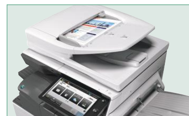
Sharp's ImagesSEND™ feature provides one-touch distribution to email, cloud applications and more.