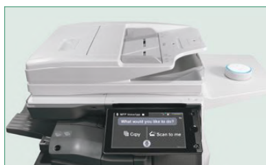
MX-M4051 shown with available Sharp MFP Voice feature with Alexa.