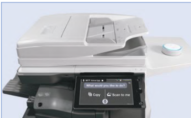
MX-M4071 shown with available Sharp MFP Voice feature with Alexa.