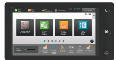
Award-winning 10.1" (diagonal) customizable touchscreen display.