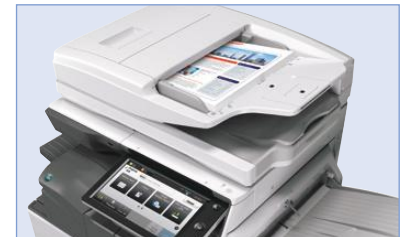
Sharp's ImageSEND™ feature provides one-touch distribution to email, cloud applications and more.