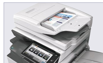
Sharp's ImagesSEND™ feature provides one-touch distribution to email, cloud applications and more.