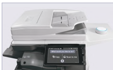
MX-M6071 shown with available Sharp MFP Voice feature with Alexa.