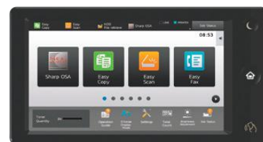
Award-winning 10.1" (diagonal) customizable touchscreen display.