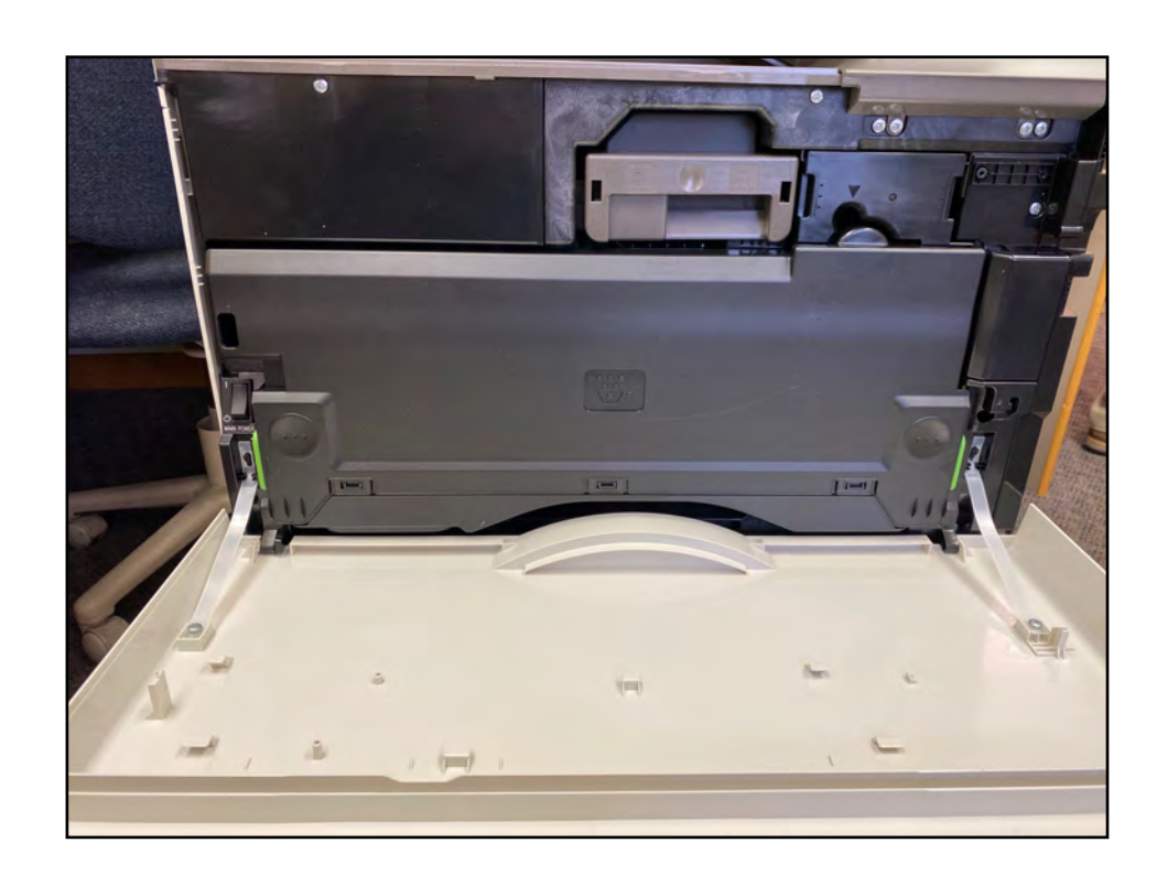
Step 2: Remove waste container